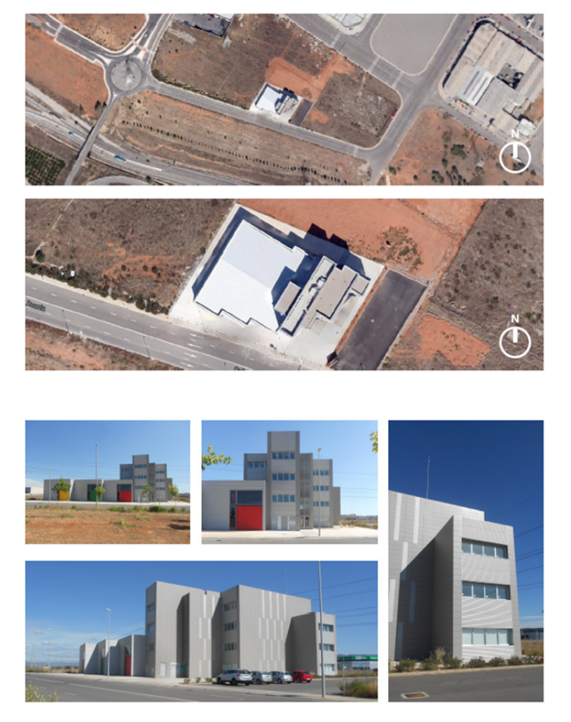
Figure 3. CIES Living Lab in Castellón

Research innovation within the CIES Living Lab will focus on developing innovative façade systems and smart office concepts. CIES is the unique Living Lab in BTA that has been built with conventional building technologies. This brand-new building provides the opportunity to test new technologies and implement new services or process for new offices as well as for office refurbishment in Mediterranean climates. The main approach of CIES is to develop measures and methodologies for assessing smart office concepts in relation to human behavior, innovative products and building technologies.