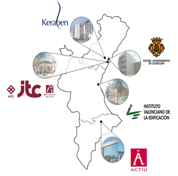
Figure 4. Real office buildings demonstrators for SSO project.

The project accounts with the involvement of some real office buildings demonstrators (as shown in the following figure) that will be monitored in order to obtain primary data regarding indoor environmental quality (temperature, lighting, acoustics, workplaces ergonomics, furniture, materials, etc.) as well as indicators of health, well being, productivity and other psychological aspects of office users (comfort, absenteeism rate, values, attitudes, need for privacy, company incentives, goal achievement, quality of work, creativity, etc).